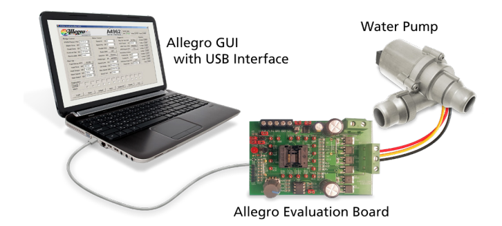
Figure 2: Allegro's software sets parameters and loads them directly into EEPROM. Evaluate changes in realtime.

standalone operation by integrating closed-loop speed or torque control. Comprehensive diagnostics feed back to the ECU, providing detail about synchronization, overvoltage, undervoltage, or shorted MOSFET conditions. Single wire operation can be achieved by sending fault diagnostics over the PWM input. The highly versatile algorithms offer a wide range of programming parameters, enabling engineering to reuse hardware for different products by simply modifying parameters within on-chip EEPROM. This makes Allegro's programmable motor drivers easy to use and reuse for a wide variety of motors, loads, and applications. Up-integrated ICs, along with Allegro programming tools, simplify workflow and shorten design cycles, promoting customer innovation. These solutions enable manufacturers to achieve demanding fuel economy standards through electrification while also providing improved performance to the end customer.